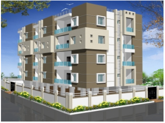
NAVYA SAI NIVAS At Kondapur