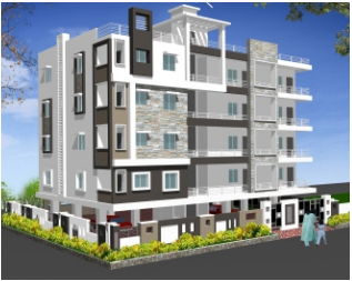
NCR NAVYA SAPPHIRE At Kondapur