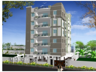
NAVYA GLASS EMERALD at Malakpet